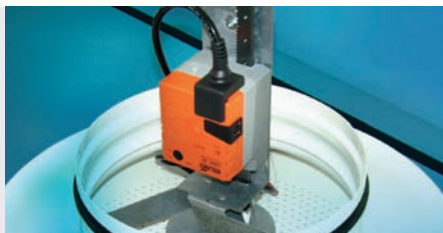
Ceiling air outlet